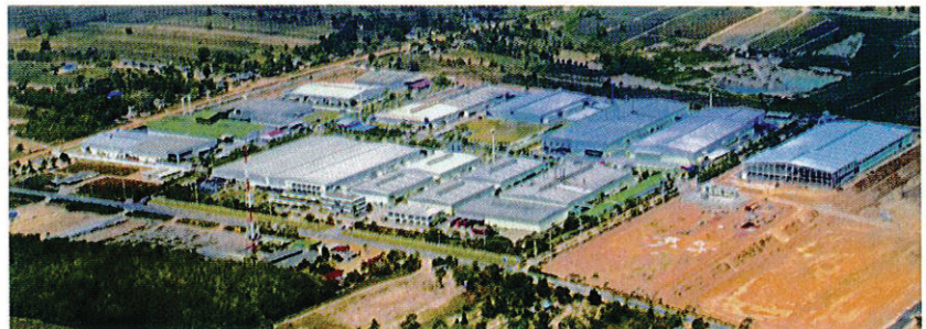
Eastern Polymer Industry Co.,Ltd./Aeroflex International Co.,Ltd. Total area 1,000,000 m 2 (10.8 million ft 2 )